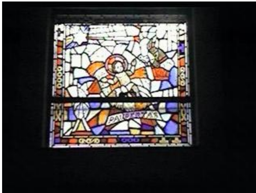
Stain glass window which is in the present Library.