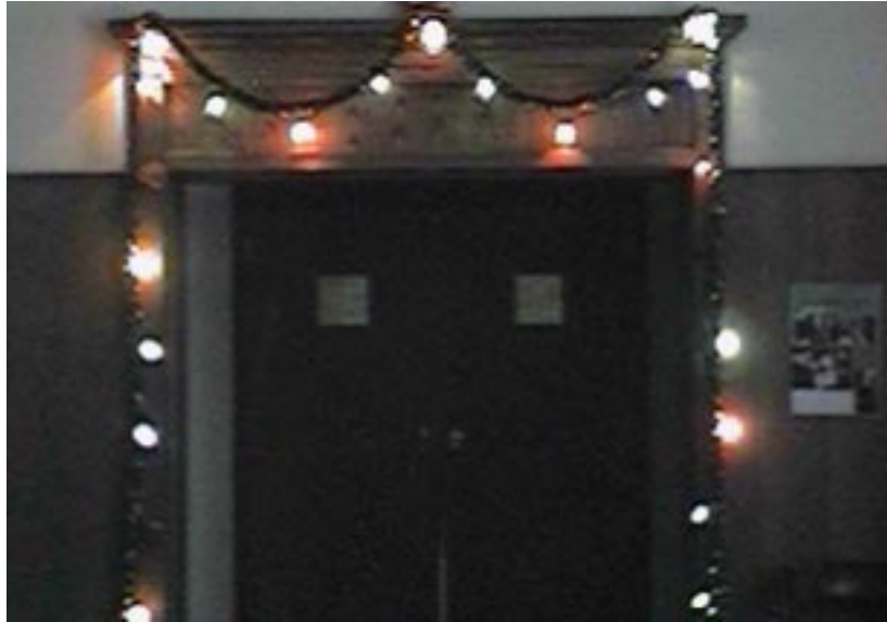
The door which leads from the rec room to the hall way.