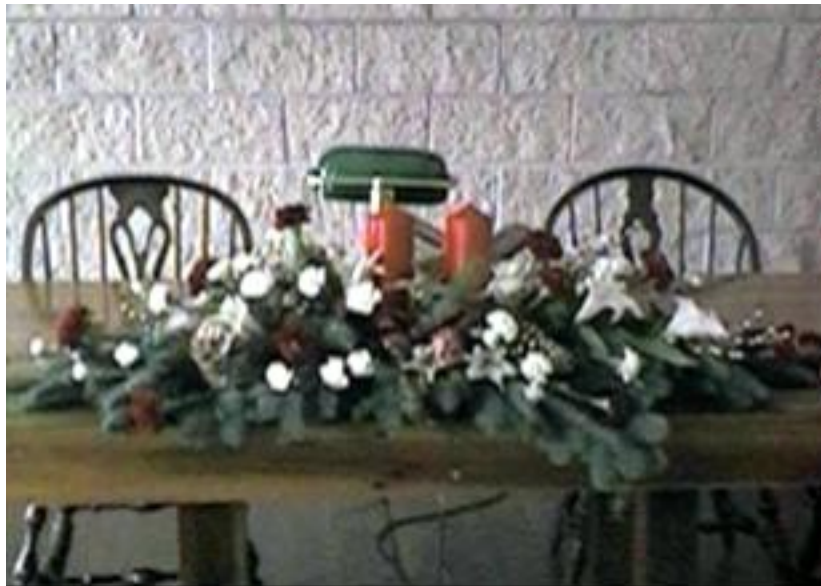
The Abbot's table in the dinning room.