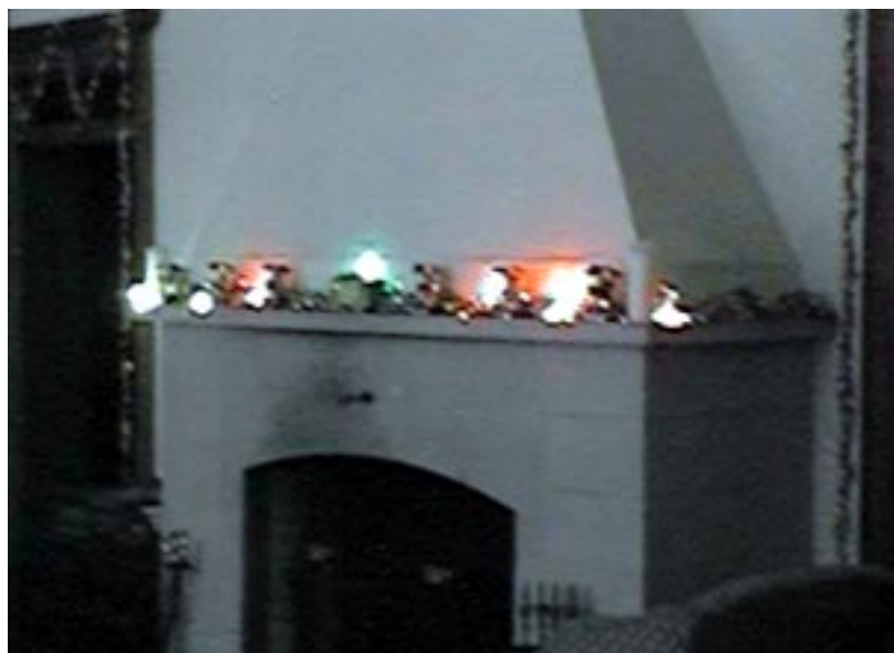
Decorations on top of the fire place in the rec room