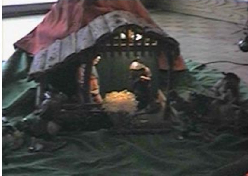
The Manger scene under the Christmas tree in the rec room.