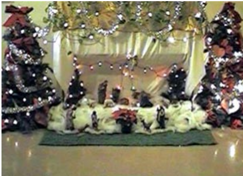
The manger scene in the hallway of the Abbey infirmary.