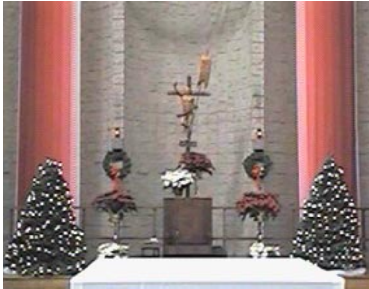
Main Alter and Chair in Church