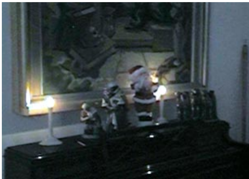
Decorations on top of the piano in the rec-room.