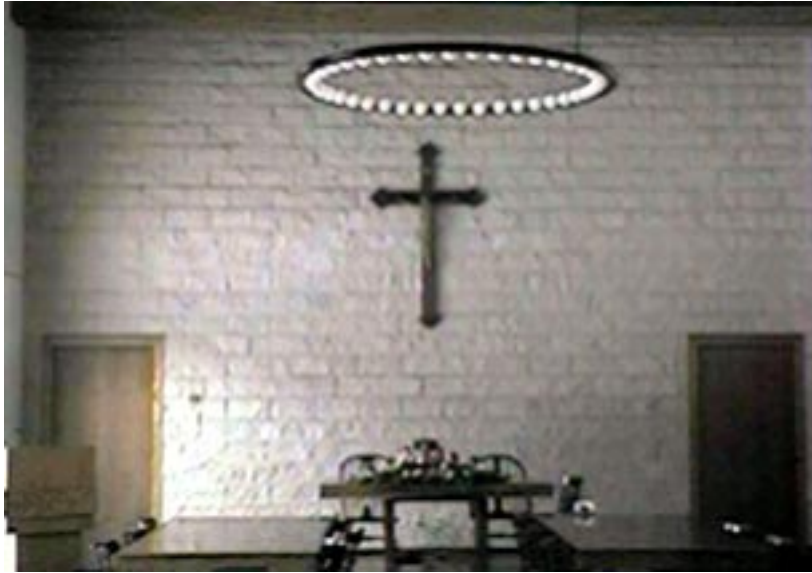
This is our dinning room which shows the Abbot's table with the flower center peace.