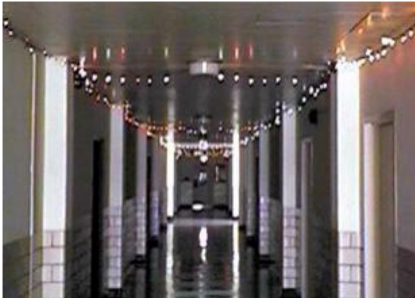
Third floor hallway showing Christmas lights.