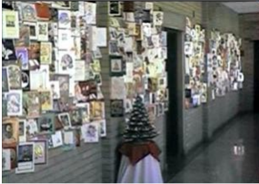
The hallway outside of the Abbot's office displaying Christmas Cards.