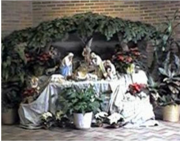
The Manger scene in the entrance to the Abbey.