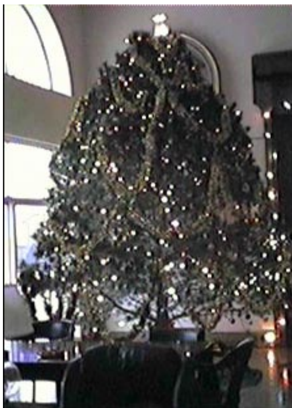
The Christmas tree in our rec- room.