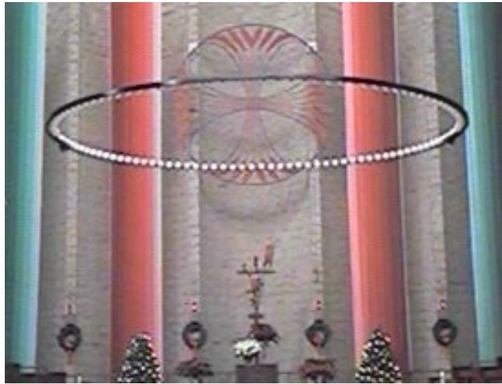
View from front doors of the church